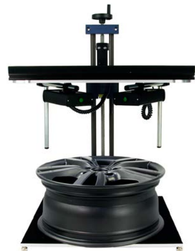
Fig. QUANTIZ® Light

testing equipment for quality management